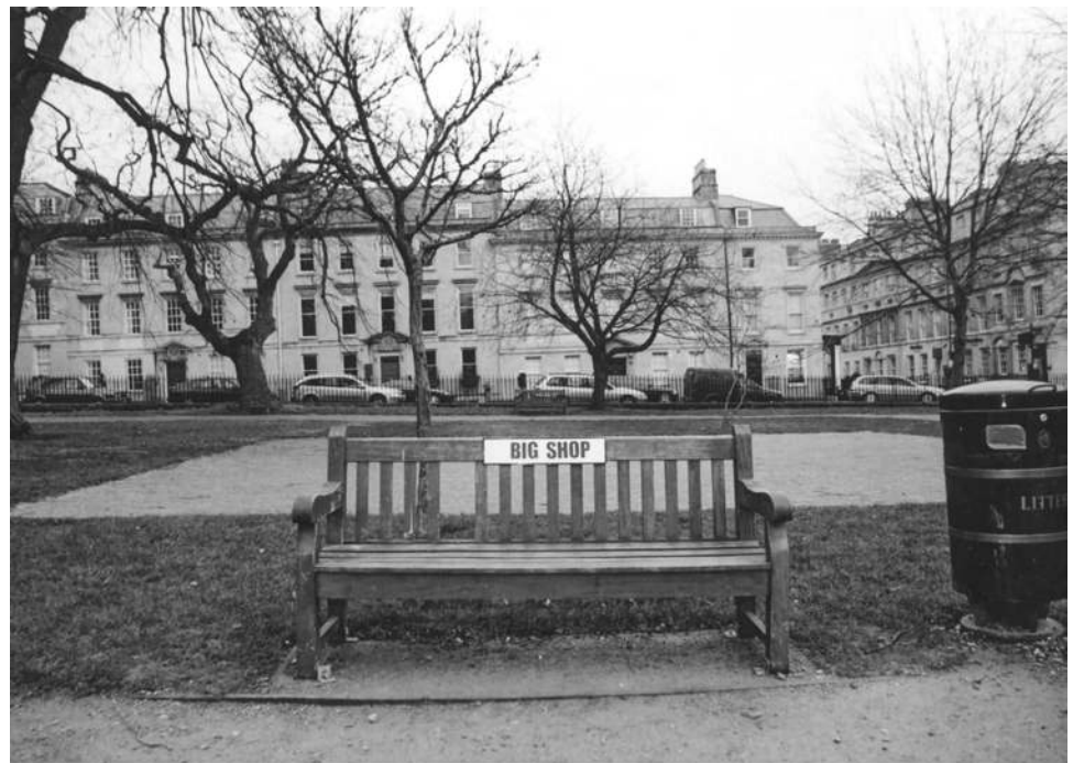
There is much more variance between a small business and a large organisation than between any two consumers.